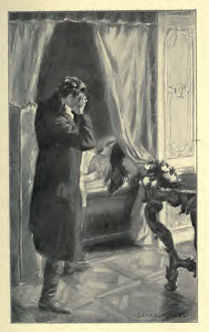
He recoiled with a heart-broken cry.